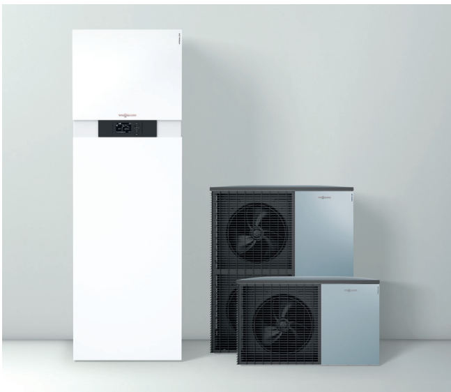
VITOCAL 222-A Air to Water Heat Pump

If your home was built before 2021, you are now eligible for generous grants from the SEAI to retrofit a heat pump.